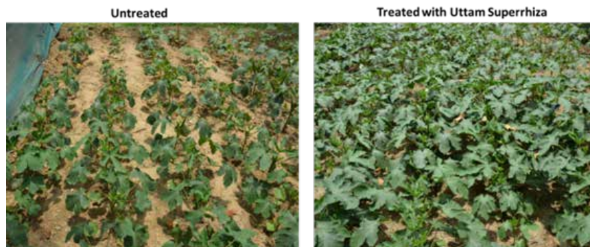
Figure 2 Impact of Superrhiza granular formulation on the growth of okra in field conditions

This is a remarkable growth promoter technology that provides native biological inputs to supplement biofertilizer performance for synergistic effects and superior field performance. Further use of sustainable practices such as composting and no-till farming will enhance soil fertility and water retention, leading to higher yields and decreased dependence on irrigation. Together with minimizing addition of chemical inputs will promote a healthier environment for farm families and communities. Additionally, it will help build healthy soils and diverse ecosystems to increase farm resilience to extreme weather events, and climate change, contributing to food security and reducing reliance on external food sources. ■