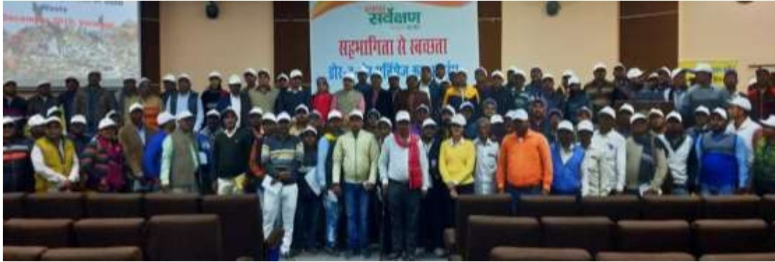
Fig-9: Health and Sanitary officers participant in training

128 Health and Sanitary workers of Varanasi Nagar Nigam participated in this training. The training was organized at Commissioner Auditorium on December 10, 2019. The objective of this workshop was to create awareness among the Health and Sanitary staff about the rule and penalty of Solid Waste Management, types of Municipal Solid Waste and handling of it. We also did focus on the importance of source segregation, Personal Protective Equipment (PPEs) and role of Health and Sanitary Staff in the workshop. The health and sanitation staff is further training residents on source segregation and proper SWM management.