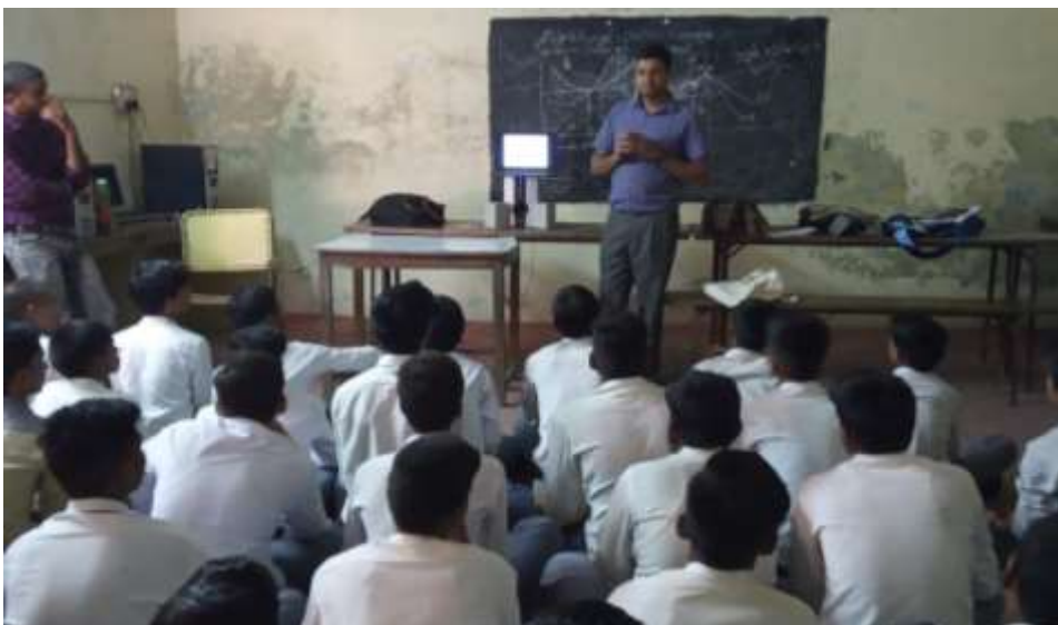
Fig-6, Waste NAMA project team members training students on source-segregation and home composting