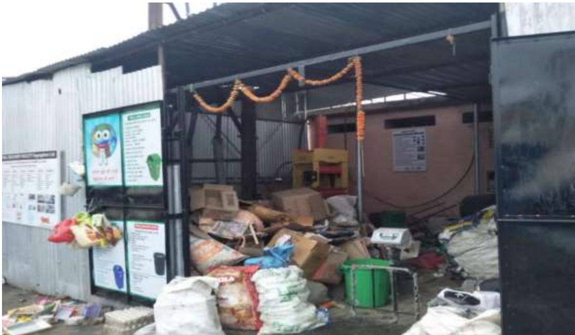
Fig-14: Material Recovery Facility at Bhawania Pokhari, Bhelupur.