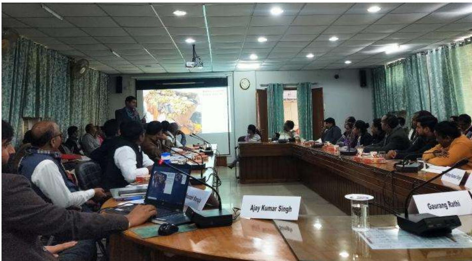
Fig-8: Participants from schools and colleges in workshop on training BWG regarding MSW Management

In this one-day workshop, 66 schools and colleges participated. After the workshop, Arya Mahila Inter College started composting of organic waste using a compost pit in college premises.