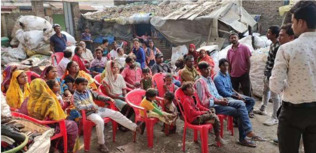
Fig-17: NAMA Project team giving a lecture to informal sector people during training