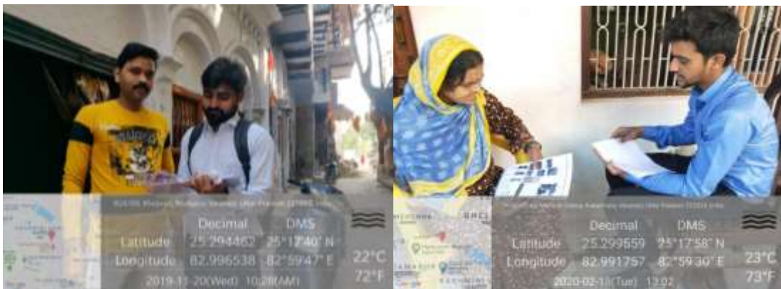
Fig 1 and 2: Door to door awareness programme by Waste NAMA Project team

NAMA project team successfully created awareness amongst residents of Varanasi Nagar Nigam wards including Sunderpur (29), Lallapura khurd (41), Gandhinagar (32), Kazipur (52), Khojwa (40), Bhelapur (45), Sudamapur (25) and Birdopur (27) through Door-to-Door awareness program on source segregation and home composting.