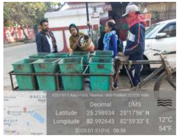
Fig-19 and 20: Waste NAMA project team collecting data from Safai Bandhus regarding door to door collection of segregated waste