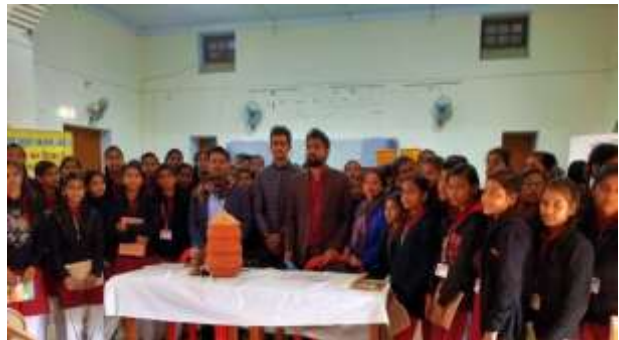
Fig-5: Waste NAMA project team with school students during an event

“Children are our greatest treasure. They are our future”, quote by Nelson Mandela. NAMA project team has successfully trained around 300 students and teachers of Madan Mohan Inter College, Kamlapati Tripathi girls inter college, Arya Mahila inter college and Kashi balika shiksha niketan about source segregation and low carbon MSW management. Project also offered a set of home composting unit that can be used as a model to train students in future.