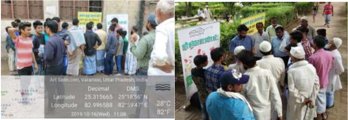
Fig 3 and 4: Public event organized by Waste NAMA project team

NAMA project team created awareness on source segregation of MSW in Varanasi with the help of public event in places like parks and madrasa. With the help of public events the project team trained around 1000 people about source segregation and home composting.