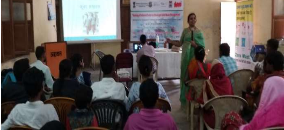
Fig-15: Workshop for Informal sector

Informal Sector plays an important role in Solid Waste Management. A workshop was organized by NAMA project team to train the informal waste workers