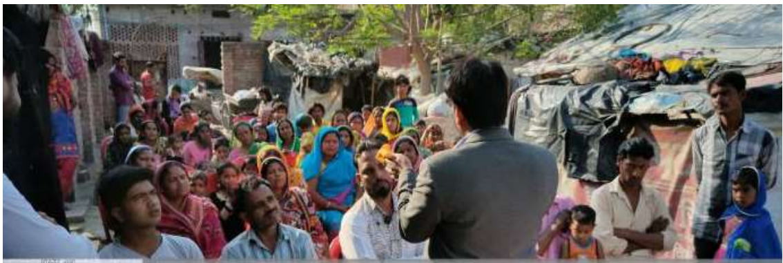
Fig-16: During training of people linked with Informal Sector

In partnership with Tetra Pak Pvt Ltd the Waste NAMA project team is conducting training for informal waste sector workers in different locations. Total 3 training camps have been organized with 120 participants. The objective of these workshops was to increase awareness about proper MSW Management, health and safety issues. Introduction to MRF and its importance is also part of the trainings. Many waste pickers were introduced to the MRF operator for transparency in trading the recyclables.