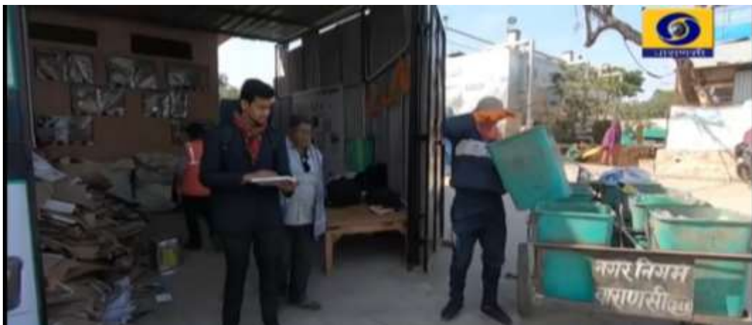
Fig-18: Data recording of collection of dry waste by NAMA project team with safai bandhu