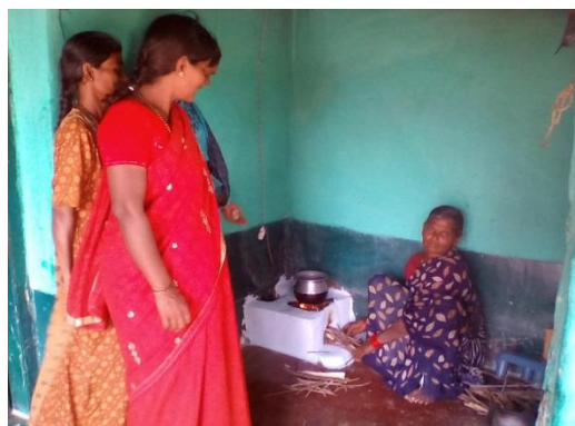
Picture 13: Low cost forced draft cook stove used by a beneficiary at K Mukhalli