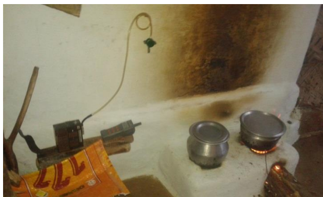
Picture 10: Mounted instruments of Dust Sampler, PO monitor with impactor