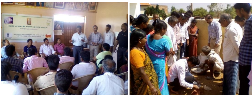
Picture 6: Training programme on construction of cook stoves conducted by TERI staff

The second training programme was on lighting devices and conducted at the TERI field office in Bhoganapura. About 30 people participated in the training including entrepreneurs who have studied ITI, Diploma, PUC, 10 th standard etc. The training programme included theory and practicals. A brief profile of the participants who attended the training programme was collected for future reference. Some of the selected participants were taken on a field visit.