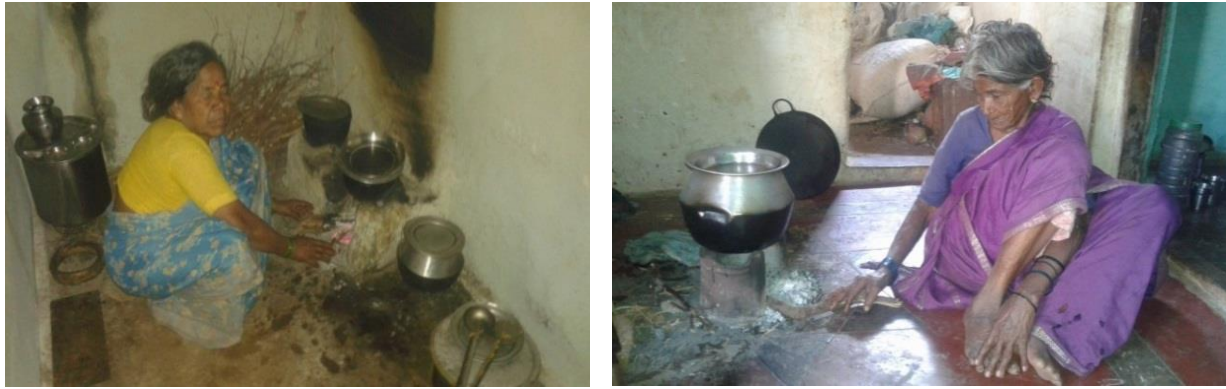
Picture 4: Traditional cook stoves and portable clay cook stove used in Bhogapura GP