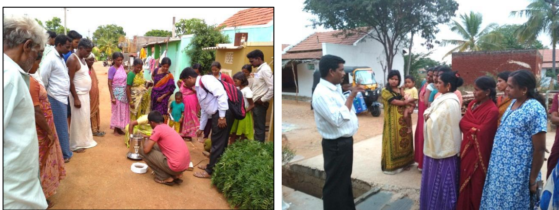
Picture 8: User training programme on top loading cook stoves at Kallahalli & solar lighting devices at Sappainapura

After commissioning the IDES low cost forced draft cook stoves and distribution of top loading forced draft cook stoves, TERI team along with EEs conducted 20 user training programmes. Three to four programmes were conducted in each village. During the user training, live demonstration of cook stoves and IDES were done so that the participants could understand how to feed the fuel, cleaning of ash, operational and maintenance problems, etc. In case of IDES the participants were trained in replacing fuse, wire connection, switching on and off of lights in the charges controller, etc. In addition, during the commission of IDES and Stoves, individual households were briefed on how to operate, repair and maintain the devices.