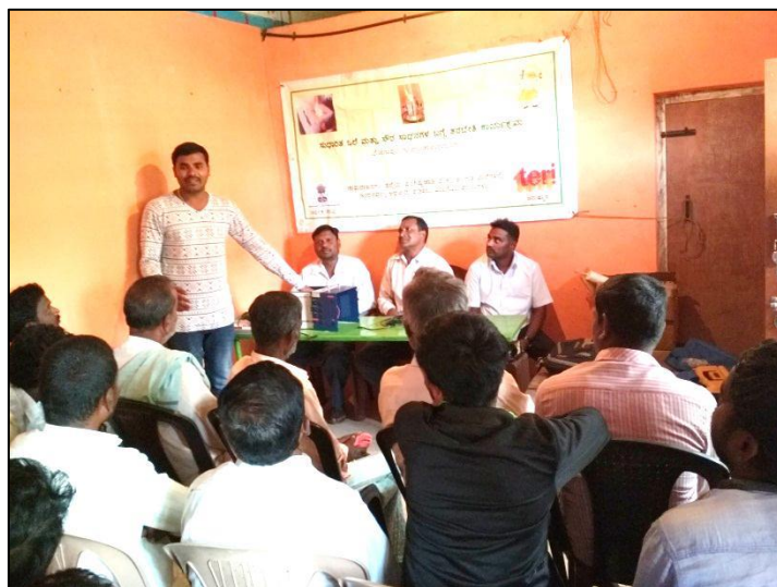
Picture 7: Training programme on solar lighting devices repair and maintenance