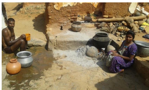
Picture 5: Three stone oven used for heating water for bathing at Kellamballi village

In southern Karnataka hot water is used for bathing purpose. For heating water a conventional oven or three stone ovens or improved oven with chimney is constructed in the bathroom separately. Generally people take bath in a separate room or thotti inside the house and some people take bath in open places outside the houses. Usually agriculture residues and fuel wood are used as fuel for generating hot water. The survey indicated that most people were taking baths two to three times per week. TERI team found that there is scope to improve the conventional oven in terms of fuel efficiency.