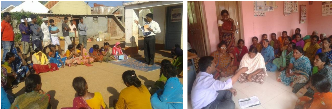
Picture 3: TERI staff conducting awareness programme at Kallahalli and Bhogapura villages

Six awareness programmes were conducted in five villages in the Grama Panchayath on the project purpose, objectives, and activities of the project. During the programme, information about the improved biomass cook stove, IDES and their advantages were explained. More than 500 people (women were more in number) participated in the awareness programme and pamphlets in local language were distributed to all of them.