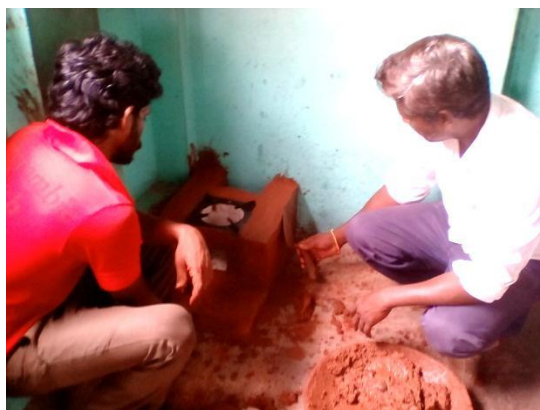
Picture 12: Construction of low cost forced draft cook stove by local masons