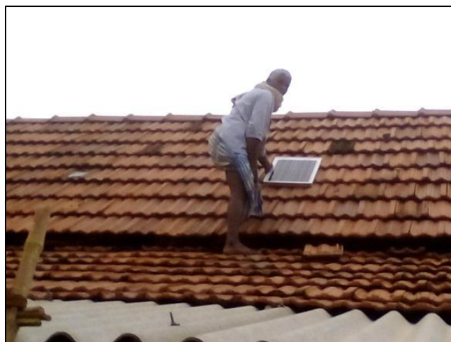
Picture 14: Installation of solar panel by beneficiary at Kellamballi

Demonstration: Five households were identified for demonstration of IDES, (forced draft cook stove, 4.8 W/12V -2 solar lights, 20W/12v solar panel, 20 Ah battery, 5A solar charge controller, mobile charging port and one extra port for power supply for stove) TERI installed the devices in selected households through the manufacturer and energy entrepreneurs and also trained the households in usage of IDES. The same device was also demonstrated to other villagers.