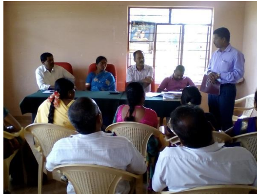
Picture 2: Conducting awareness programme at the General Body meeting in GP, Bhogapura

With the permission of the GP, TERI made a presentation on the project in the GP general body meeting. This helped in spreading information about the project among the GP officials and people. The GP members (24 members), PDO, Secretary of GP and other officers evinced a lot of interest and appreciated the project objectives. Subsequently, they assured full support for the successful implementation of the project in their GP.