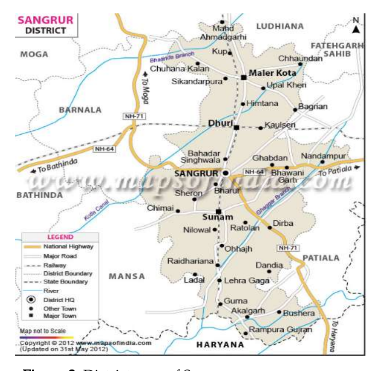
Figure 2: District map of Sangrur