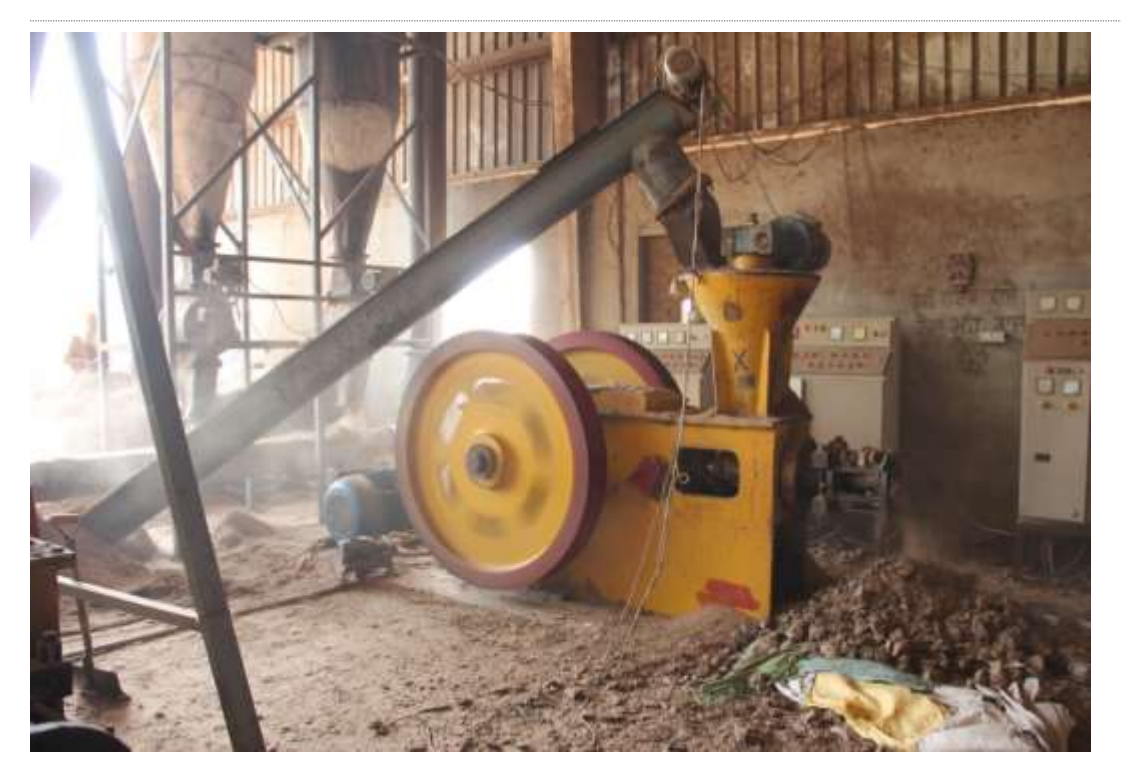
A Briquetting unit