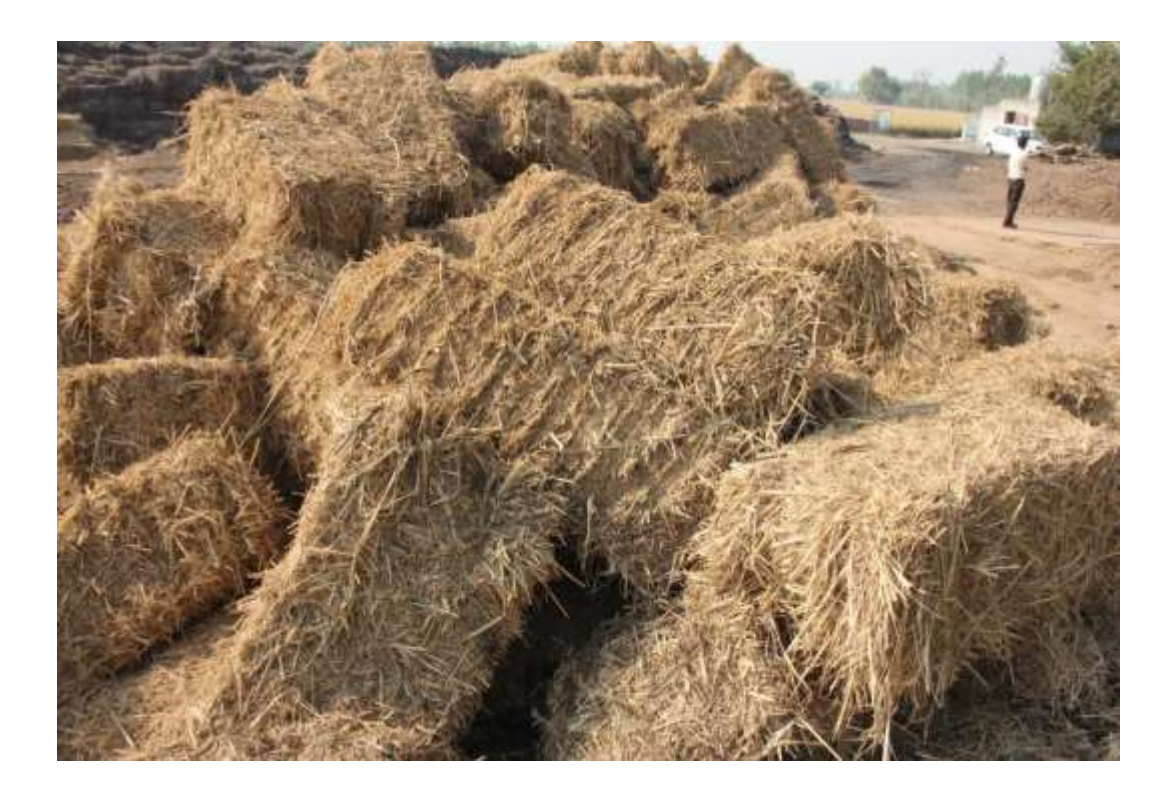
A heap of bales