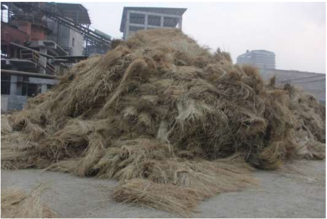
Heap of Paddy straw