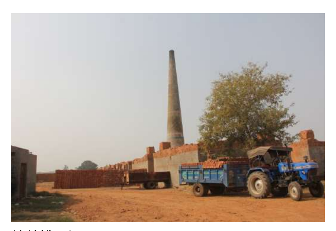
A brick kiln unit