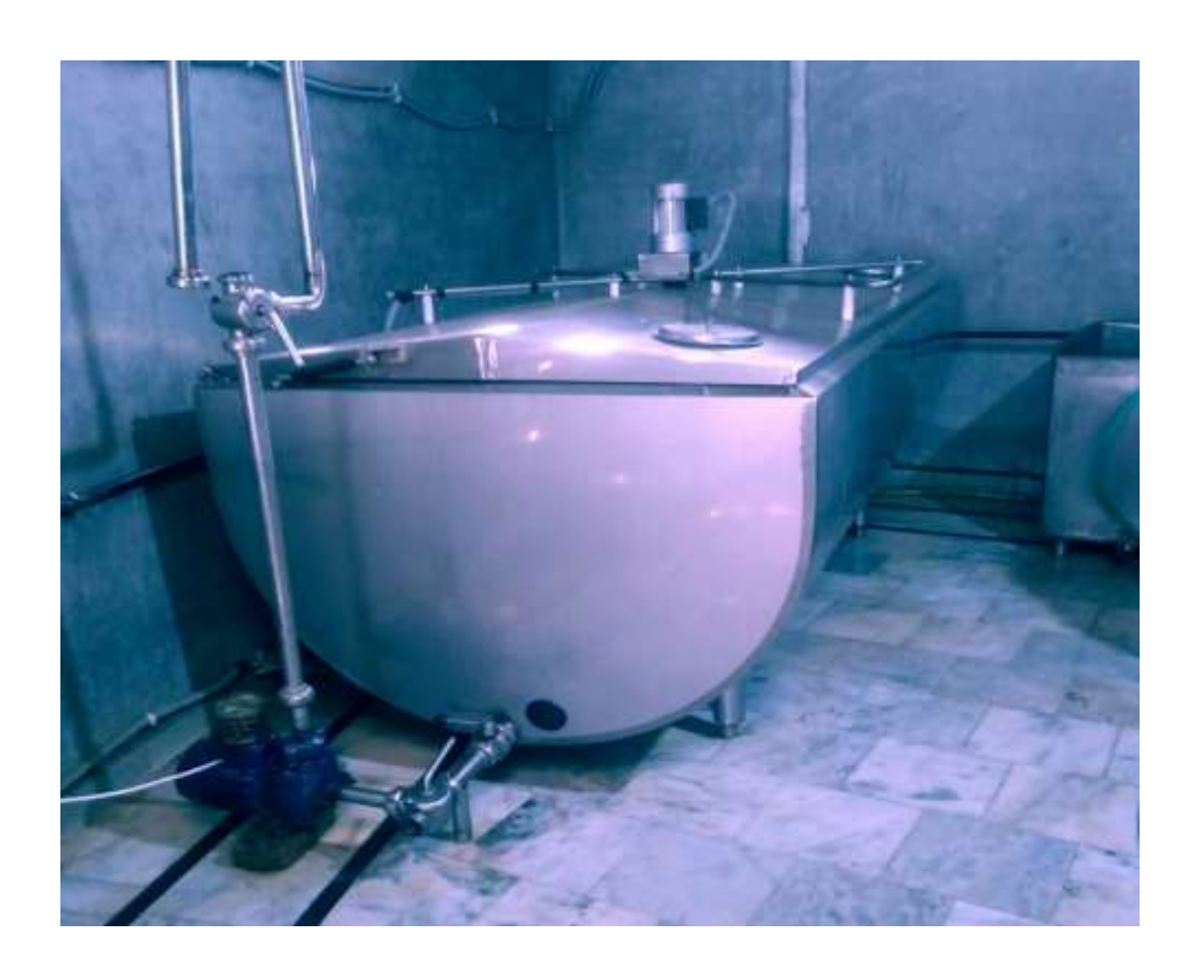
Bulk Milk Chiller