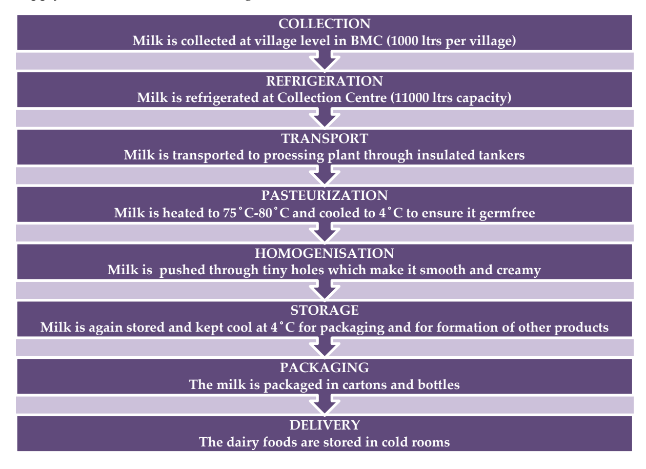
Figure 3: Milk collection, storage and supply chain mechanism in the district

The total estimated milk production in the district is about 775000 MT and out of the total milk production about 80% is assumed to be for commercial purpose and remaining is utilized for domestic consumption. It is estimated that an average of 800-1000 L of milk is collected daily in each village of the district. This milk is stored at the Bulk Milk Chiller (BMC) during morning and evening before it has been transported to milk collection and chilling facility. In the milk collection and chilling facility the surplus milk is collected from BMC plant from nearby villages. Total of 10000-12000 L of milk is stored in the Milk Collection and Chilling centre, which is then transported through milk van to milk processing units for production of milk products. The typical milk collection, storage and supply chain model is shown in Figure 3.