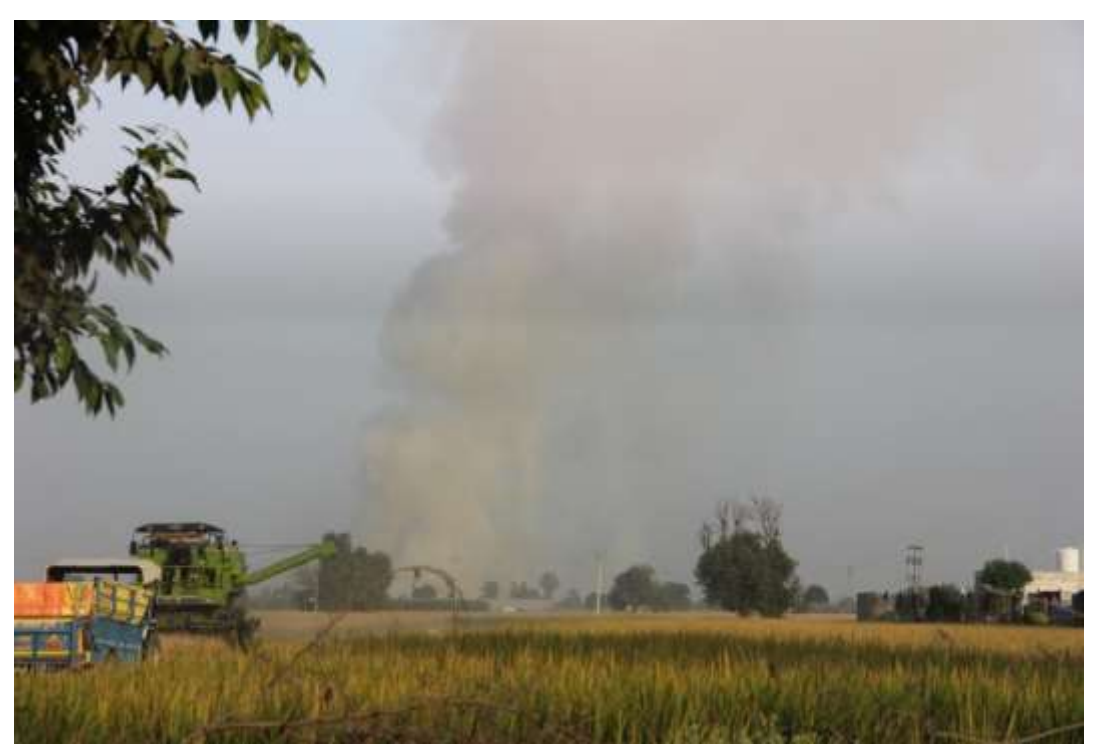
Fire incident in the field