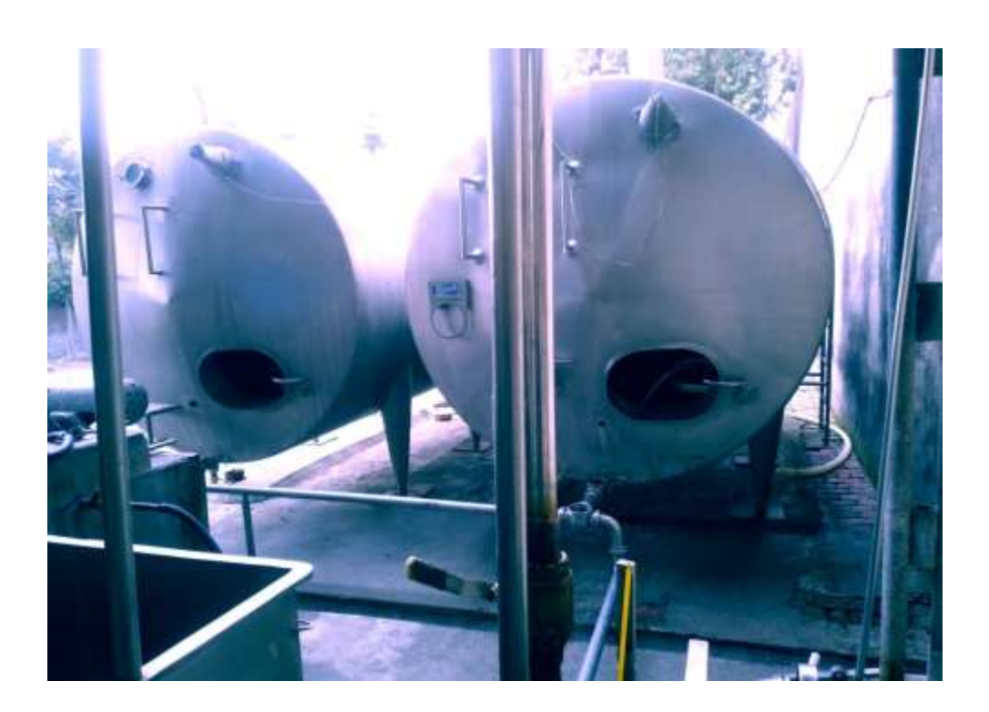
Milk Collection Centre