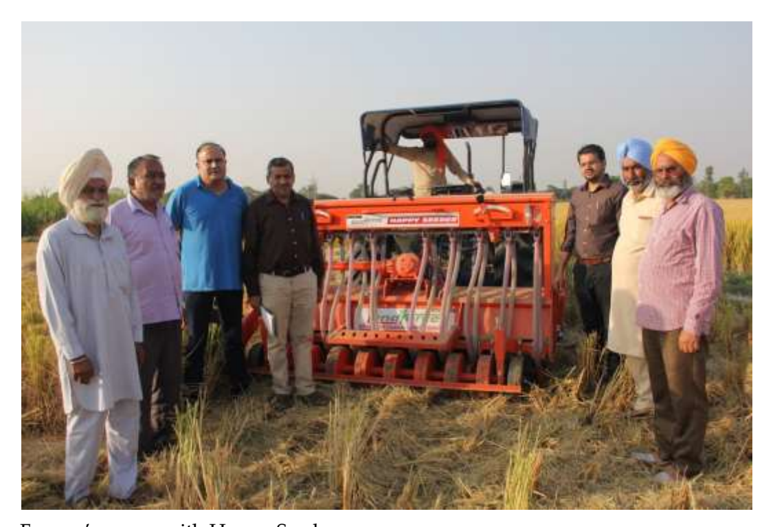
Farmer's group with Happy Seeder