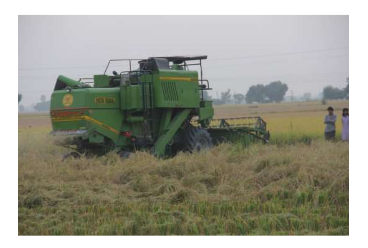
Super Straw Management System with combined Harvester