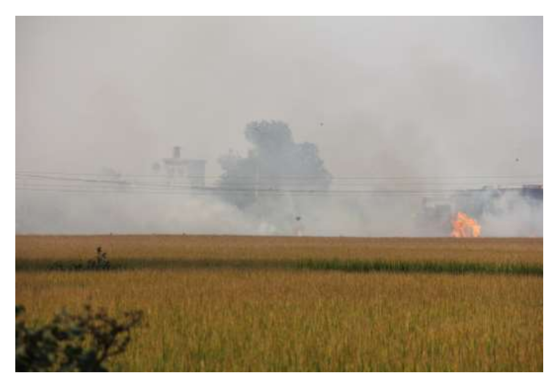
Fire incident in the field