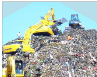
Solid Waste Management