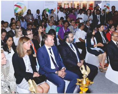
Innovation Exchange Forum

Along side the trade fair, we bring you various knowledge-rich supporting program sessions to add more value to your exhibition visit. The program includes sessions in our Innovation Exchange Forum , Active Learning Center as well as a Buyer Seller Forum and Business-to-government meetings which will take place during the show days.