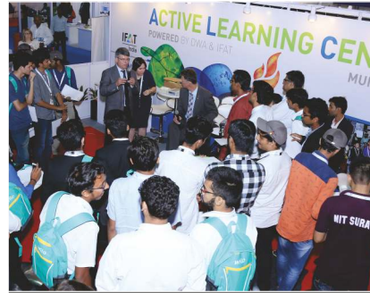
Active Learning Center

Designed to deliberate and exchange ideas and highlight solutions for a sustainable Water, Waste & Resource Management in India. The forum features key notes and panel discussions.