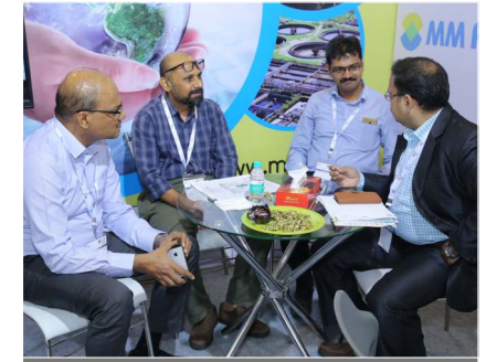
Buyer Seller Forum

A unique platform where business professionals come together and have face to face meetings with government officials to deliberate on policy, regulatory and related subjects.